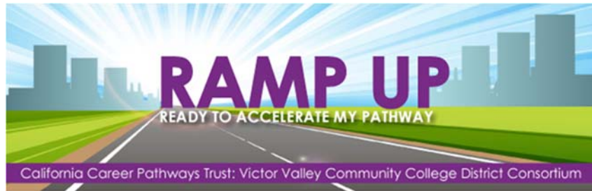
EXHIBIT IV: OUTCOMES